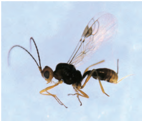
Figure 8. Parasitic wasp of cabbage seedpod weevil adults

In Europe and the United States, parasitic wasps are effective for reducing both adult and larval weevil populations (Figure 8). The most important species are Microctonus melanopus , a wasp that parasitizes adult weevils, and Trichomalis perfectus , a wasp that attacks weevil larvae within the pods.