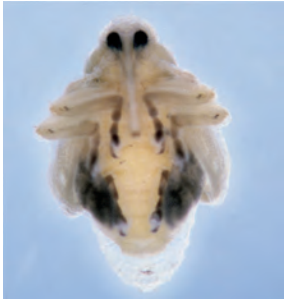
Figure 5. Cabbage seedpod weevil pupae