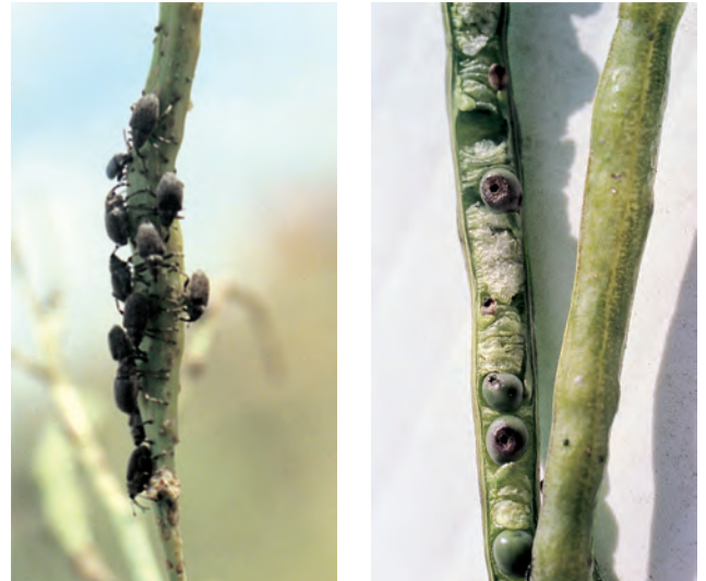
Figure 7. New generation weevil adults and feeding damage

When new generation adults emerge in late summer, they can invade nearby fields and damage the immature pods of late-seeded canola by feeding directly on the seeds through the pod walls (Figure 7).