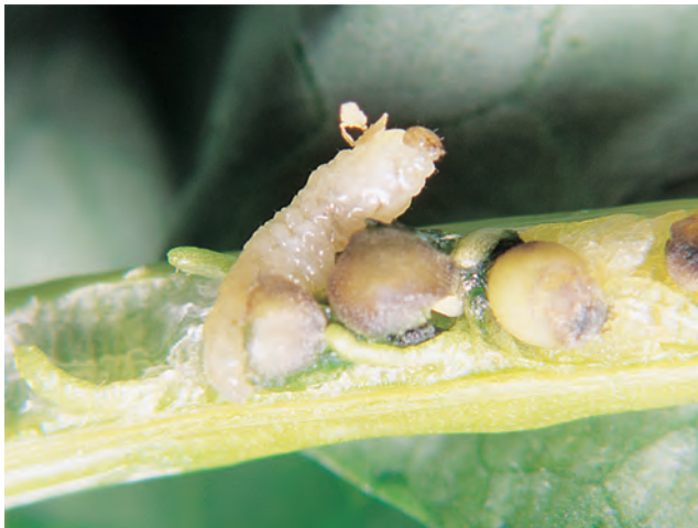
Figure 3. Cabbage seedpod weevil larva

Larval development takes approximately six weeks, and during this time, a single larva consumes five to six canola seeds. There are three larval stages (instars).