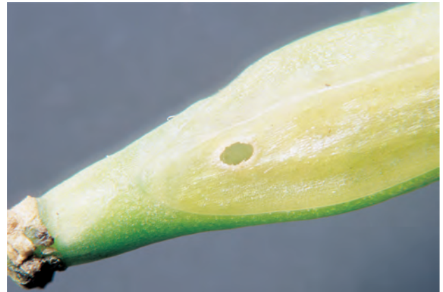
Figure 4. Cabbage seedpod weevil exit hole

Mature larvae chew small, circular exit holes in the pod walls, drop to the ground, burrow in and pupate within earthen cells (Figure 4). New generation adults emerge about 14 days later and feed on immature canola or other green cruciferous plants until late in the season when they enter overwintering sites.