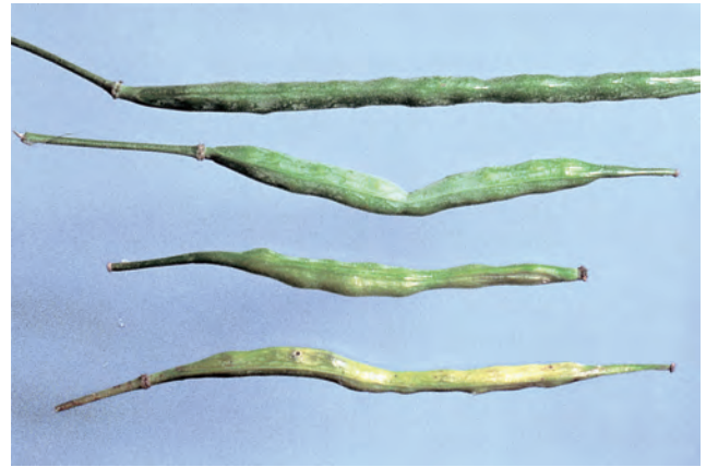
Figure 6. Normal canola pod (top) and pods distorted by internal feeding damage from cabbage seedpod weevil larvae

Canola pods harboring cabbage seedpod weevil larvae often appear distorted. When larvae consume some seeds within pods, the undamaged seeds enlarge and mature, often leaving misshapen pods (Figure 6).