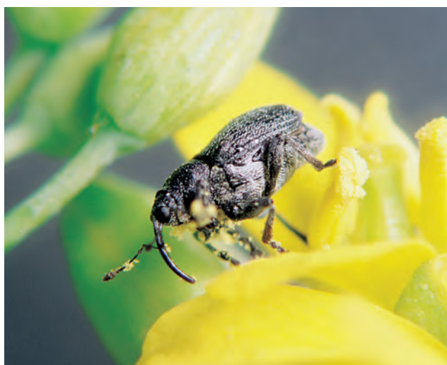
Figure 1. Adult cabbage seedpod weevil on canola

The cabbage seedpod weevil ( Ceutorhynchus obstrictus ) was introduced to North America from Europe about 70 years ago. The weevil was discovered in British Columbia in 1931, and from there, it dispersed south and eastward. It now occurs throughout most of the temperate region of the United States.