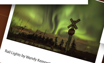
Rail Lights by Wendy Kempert