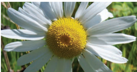
Noxious Oxeye Daisy

With the weeds come weed inspectors, who provide people with information packages if they see weeds on their property that need to be addressed. Thank you to everyone who has cooperated with our weed inspectors. If you spot any noxious weeds in the County, please give us a call at 780-532-9727.