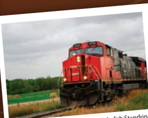
Here Comes the 4 o'clock Train by Judith Standing